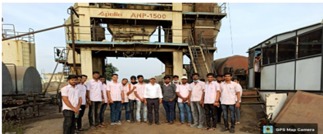
Faculty and Students during the Visit