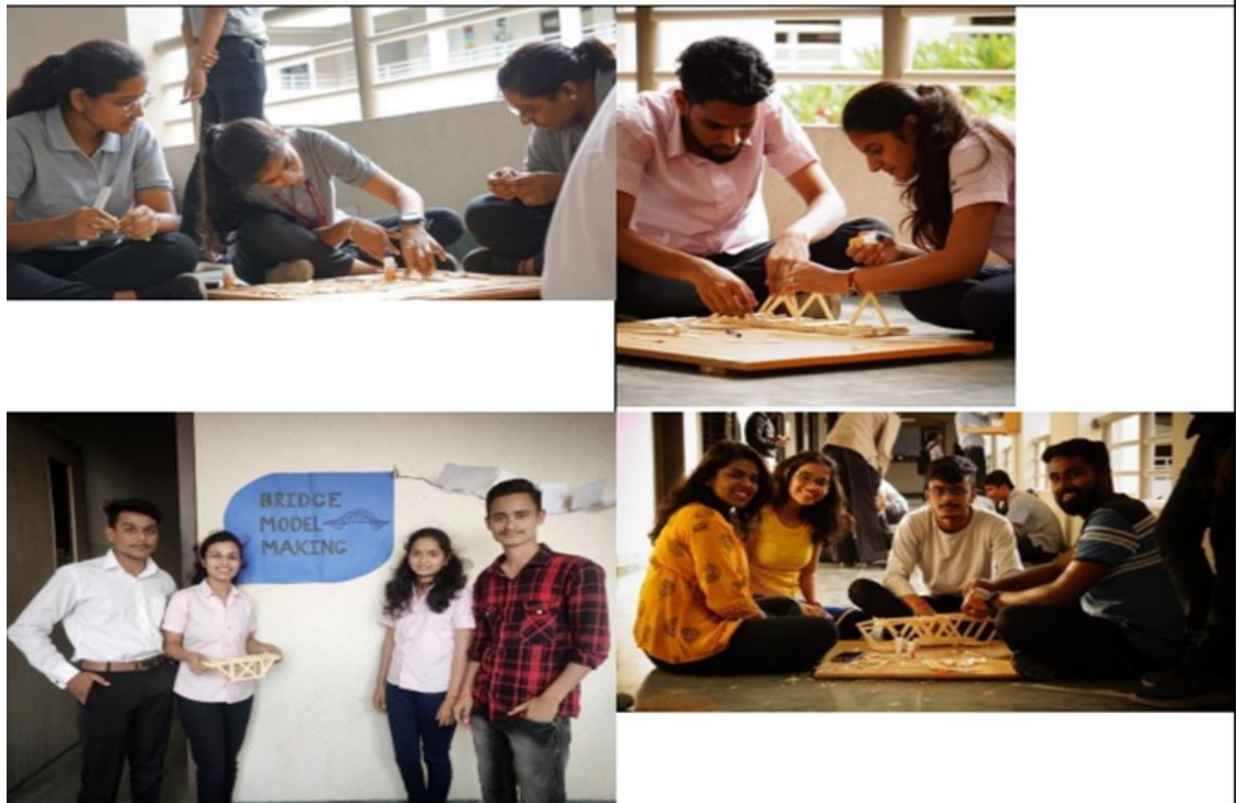
Bridge Making Competition