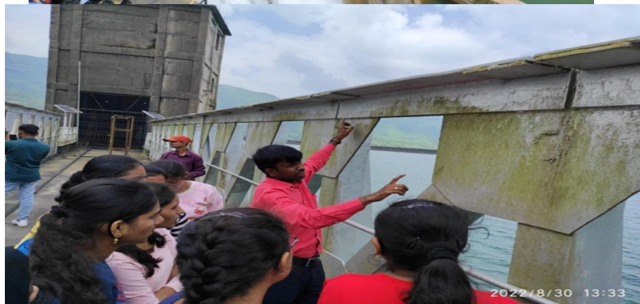
Faculty and Students during the Visit